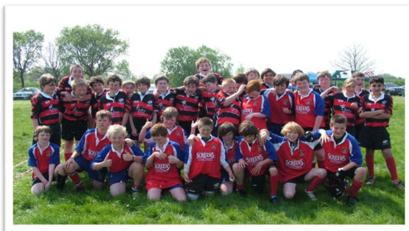
BGYRFC Mini & Youth Chairman