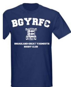
BGYRFC "Trainee Superman" T-shirt