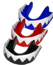
"Gilbert" Gum shield